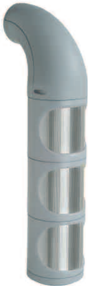
LED Traffic Light (3 tier)