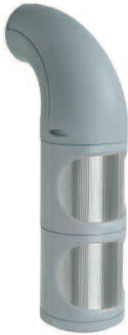
LED Traffic Light (2 tier)